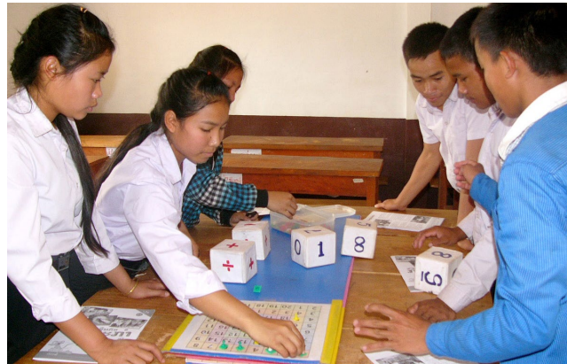
Figure 3. Upper primary math games

Source: "Discovery Days" festival in Luang Prabang, Laos, organized by Big Brother Mouse, a literacy organization; photo by Blue Plover [CC BY-SA 3.0], via Wikimedia Commons.