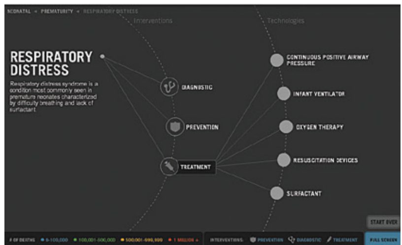
Condition and subcause, as well as the associated current standard-of-care technologies for prevention, diagnosis, and treatment.