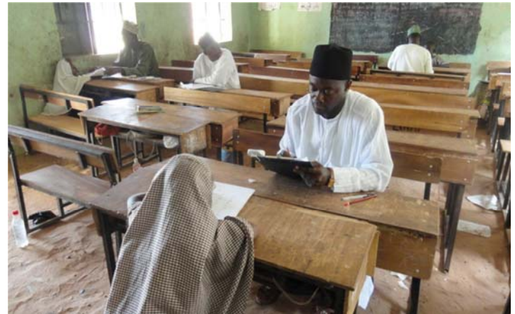
Administering EGRA in Hausa as part of the USAID Nigeria Northern Education Initiative.

EGRA in Africa has served two main purposes: (1) to provide key decision makers and stakeholders with an overview of students' reading skills at the national or regional level (e.g., Ethiopia, The Gambia, Ghana, and Kenya); and (2) to inform the development of reading interventions and to assess their impact (e.g., Girls' Improved Learning Outcomes (GILO) in Egypt, Early Grade Reading Intervention in the Gambia, EGRA Plus in Liberia, Read-Learn-Lead in Mali, Systematic Method for Reading Success (SMRS) in South Africa, and Breakthrough to Literacy in Zambia). To date, EGRA has been implemented in 36 different languages in 19